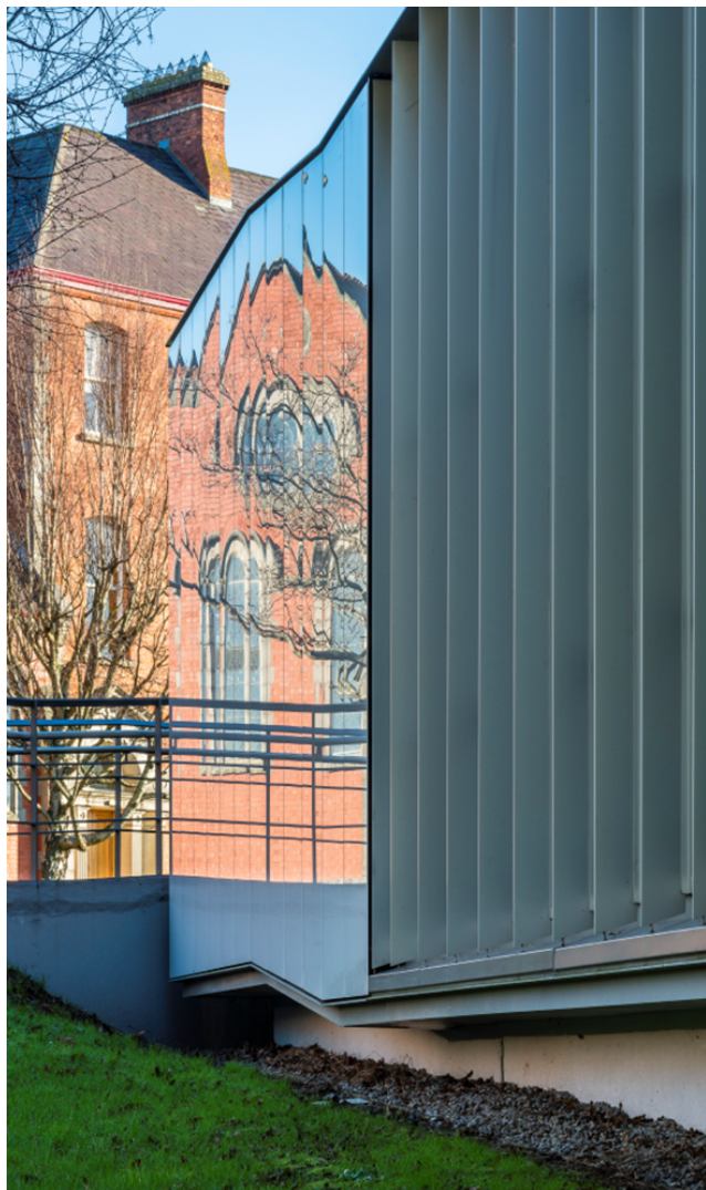
Photo: Chapel reflection captured on side of building.

Visit our website www.margaretaylwardcentre.ie